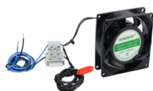
ARAW45 Fan with temperature sensor 45°C